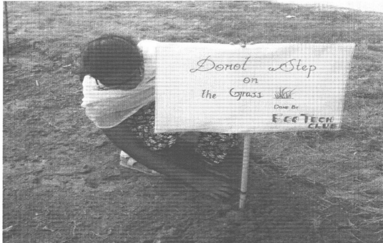
CLEAN AND GREEN CAMPUS DRIVE