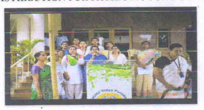
PATRIOTIC SONG BY STUDENTS