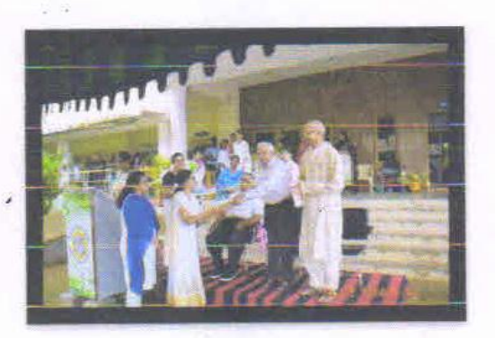
PRIZE DISTRIBUTION FOR PATRIOTIC SONG COMPITITIO