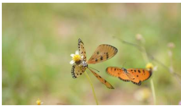
Butterflies and moths spotted in the campus