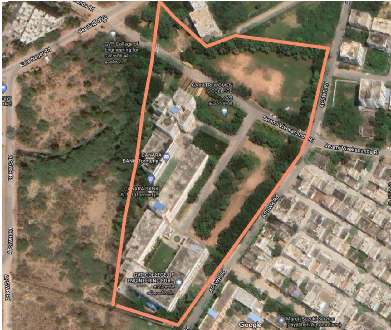
Location of campus in Visakhapatnam city