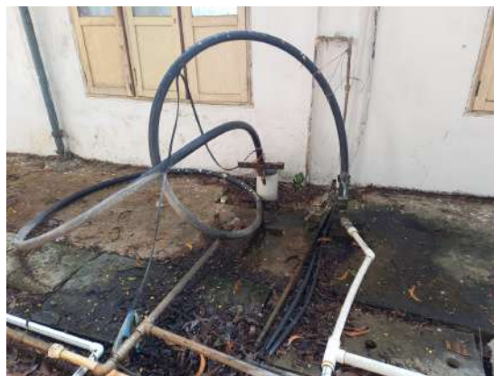
Two of the 3 borewells in the campus