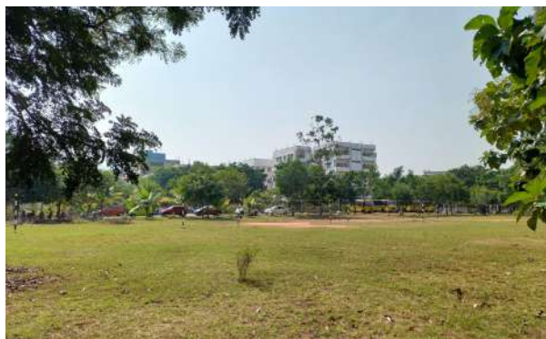
Overview of campus from ground