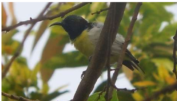
Purple rumped sunbird