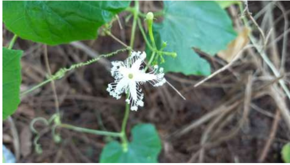
Wild flowers and vines